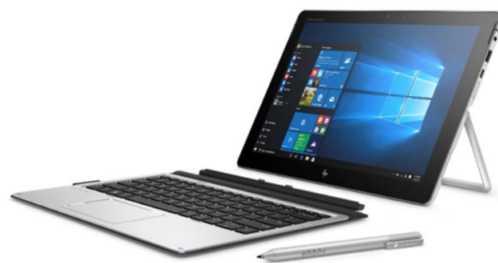
HP Elite x2 1012 G2 Tablet

https://support.hp.com/us-en/document/c05415563#AbT11